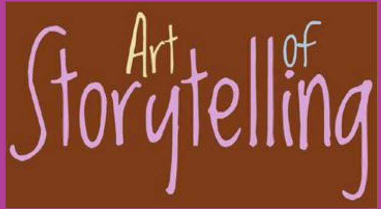
Image Created at Wordle.net