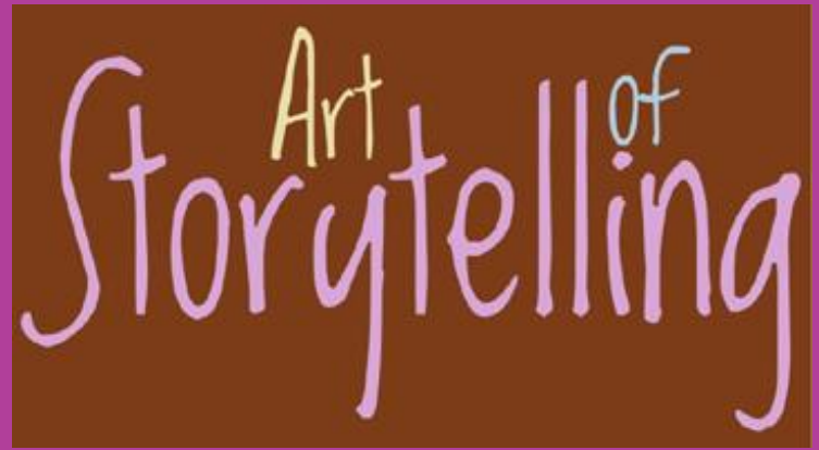
Image Created at Wordle.net